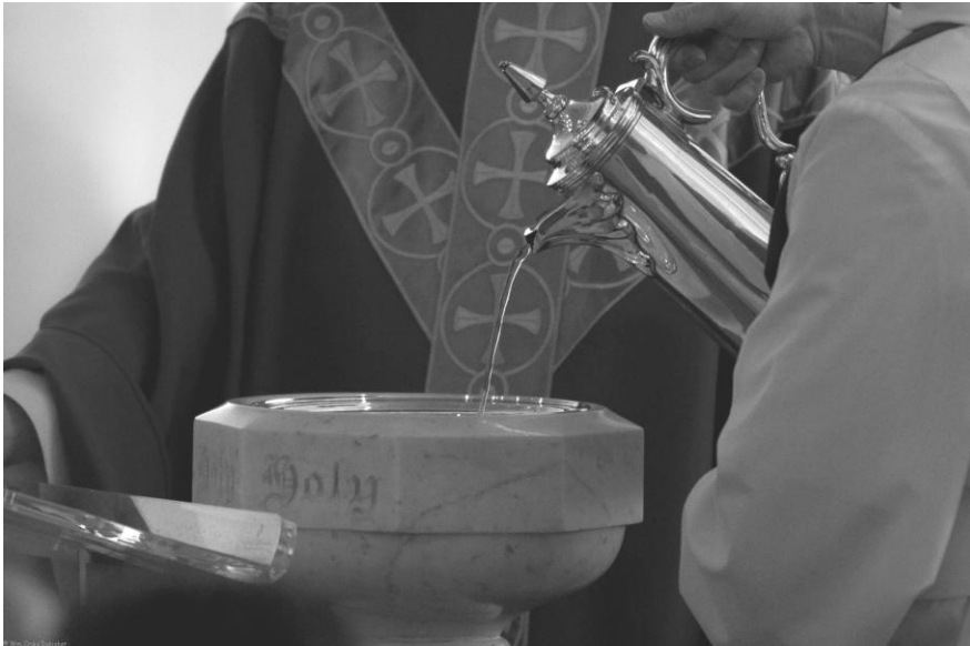
Water Poured for Baptism