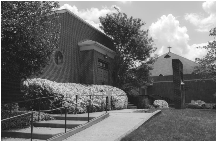
Entrance Facing Van Buren Street