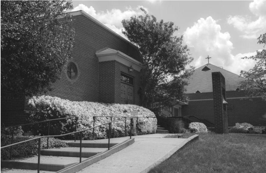
Entrance Facing Van Buren Street