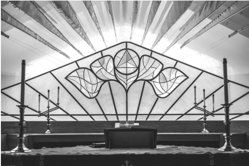
The Altar Photographer, Craig Dubishar