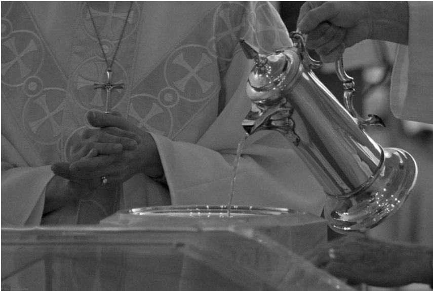
Pouring water for Baptism