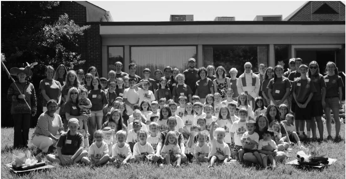
VBS Group Photo