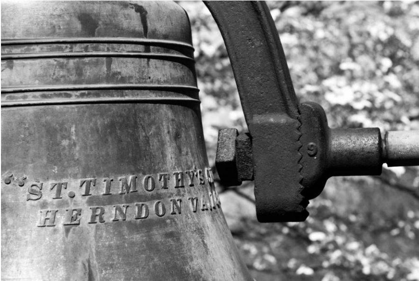
Church Bell