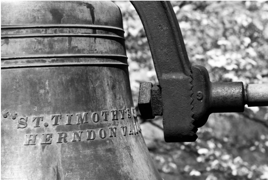
Church Bell