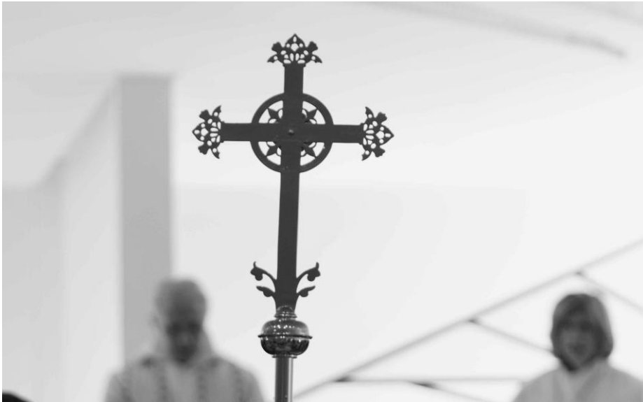
Processional Cross In Focus while in procession