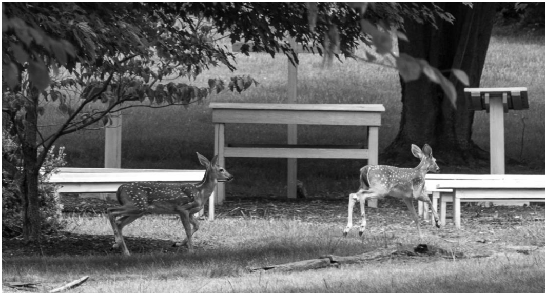
Fawns at the Outdoor Chapel