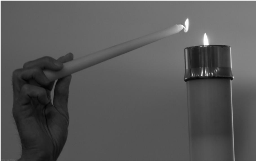
The Lighting of the Paschal Candle