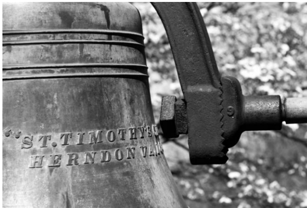
Church Bell