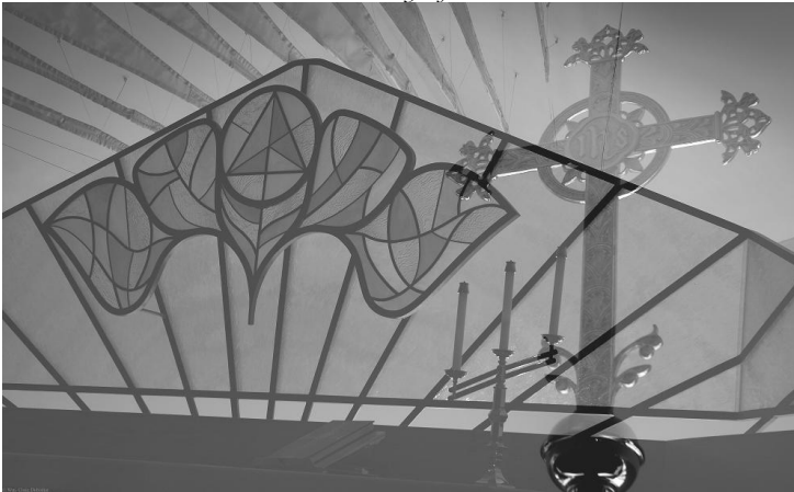
Altar/Processional Cross Collage