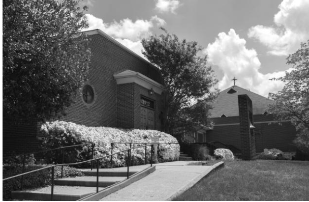
Front Entrance