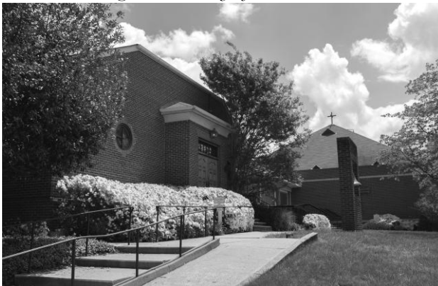
Front Entrance