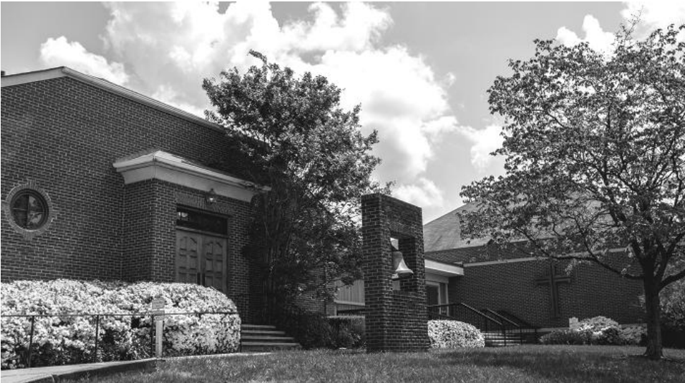
Front Entrance facing Van Buren St.