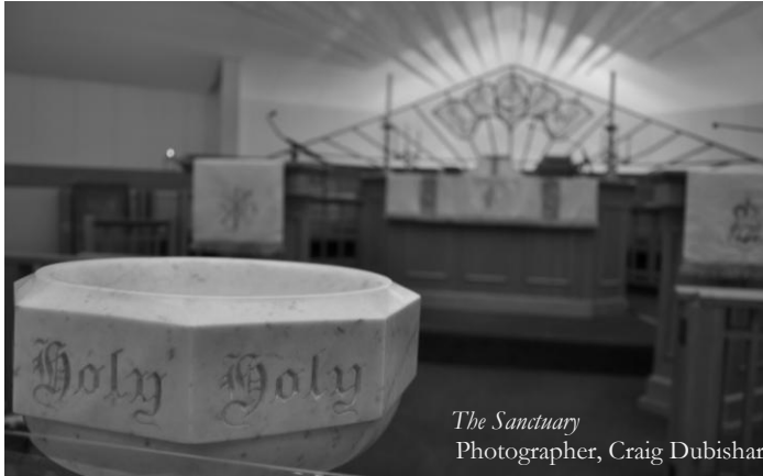
The Sanctuary