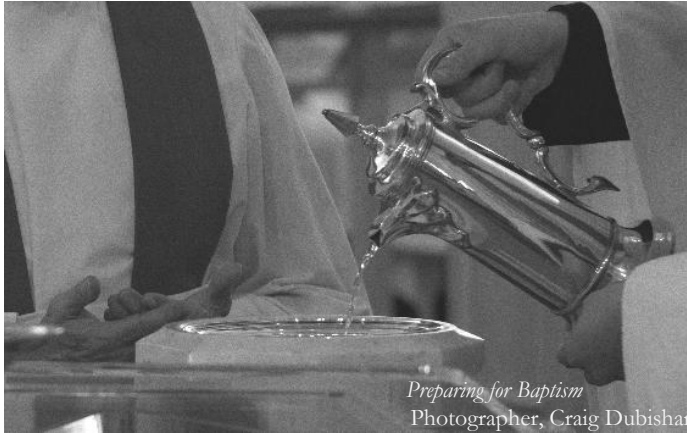
Preparing for Baptism