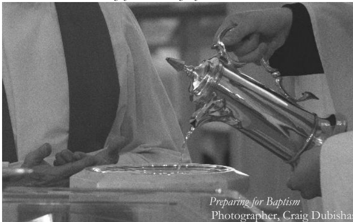
Preparing for Baptism