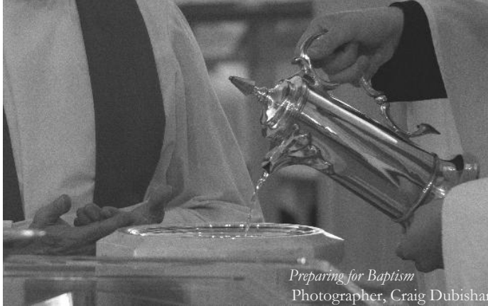
Preparing for Baptism