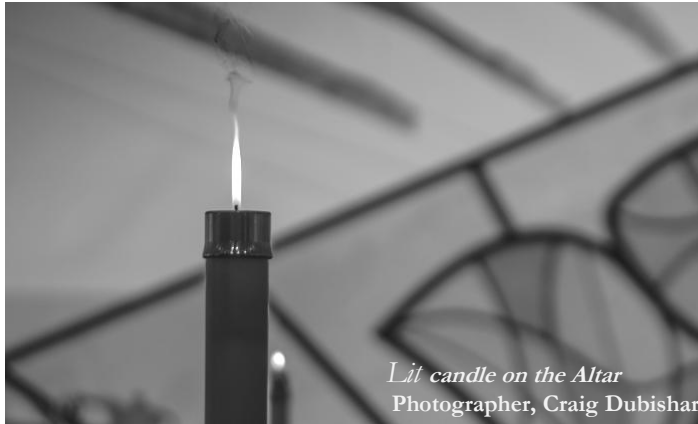
Lit candle on the Altar