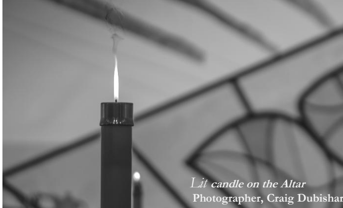
Lit candle on the Altar