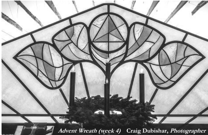
Advent Wreath (week 4)