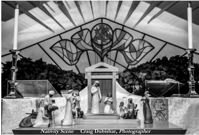
Nativity Scene