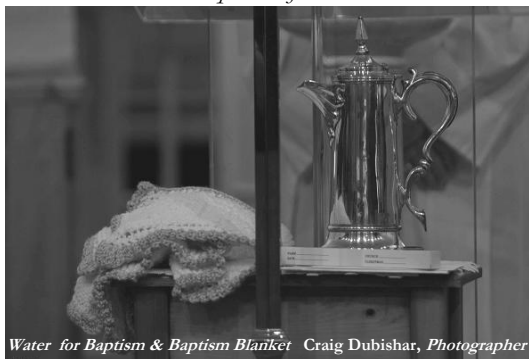
Water for Baptism & Baptism Blanket