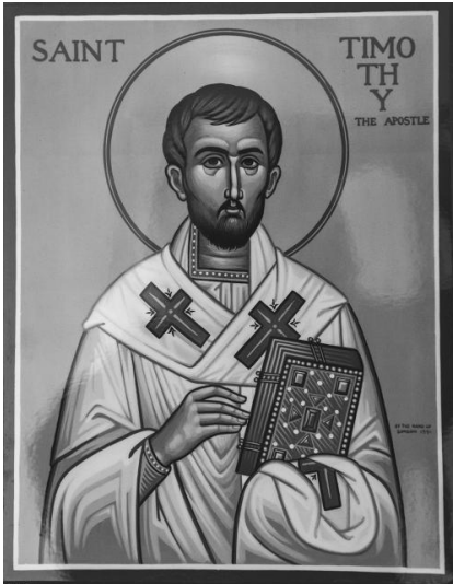
St. Timothy Icon