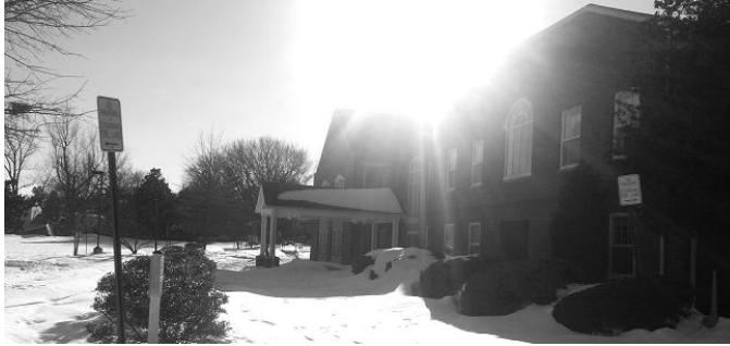
Preschool Entrance Snowed In