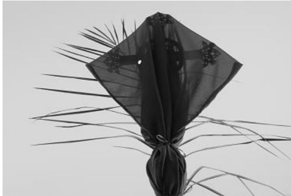
Palm Sunday Cross