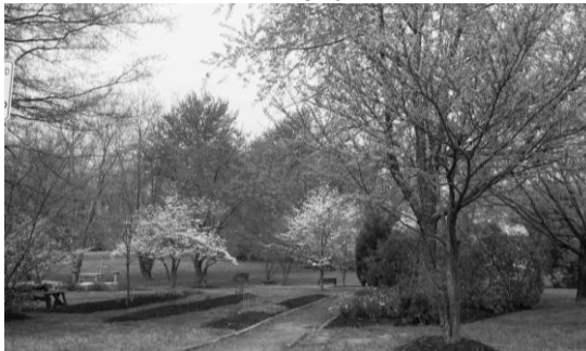
Trees beginning to bloom