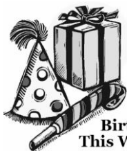
Birthdays This Week