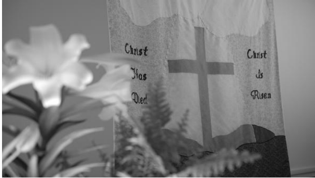
Sanctuary banner with Lilies