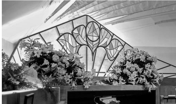
Altar on Easter