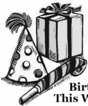
Birthdays This Week