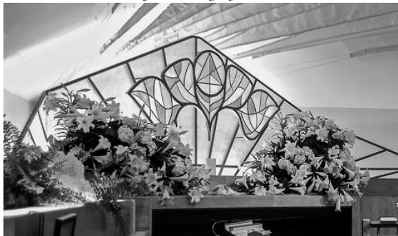
Altar on Easter