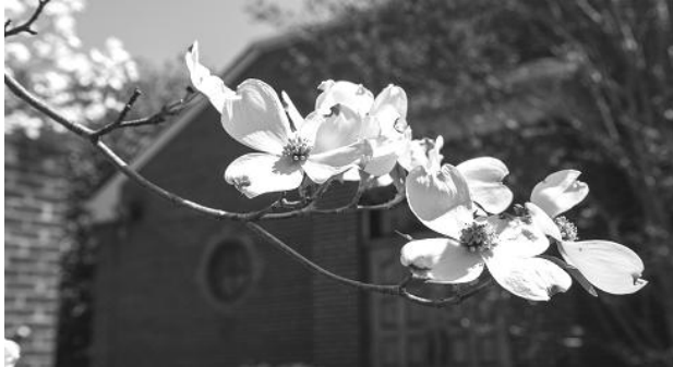
Dogwood in bloom