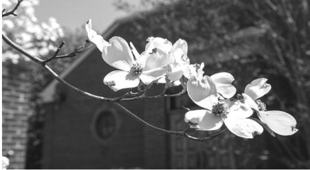
Dogwood in bloom