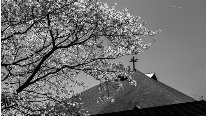
Sanctuary Rooftop Cross