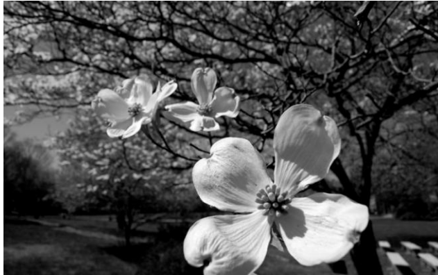
At the Outdoor Chapel