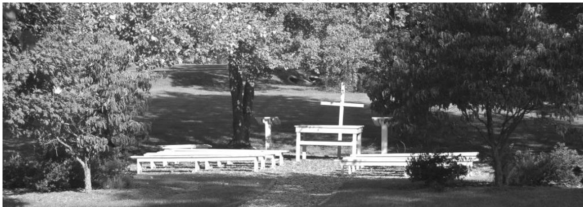
The Outdoor Chapel