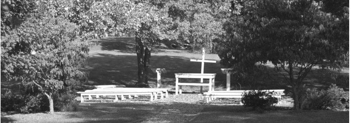
The Outdoor Chapel