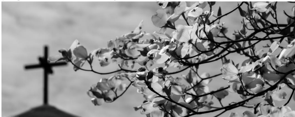
Sanctuary Steeple Cross in background