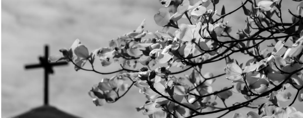
Sanctuary Steeple Cross in background