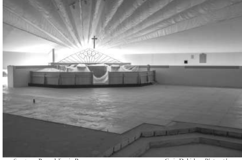
Sanctuary Remodeling in Progress