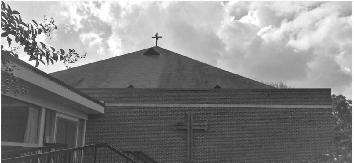
Sanctuary Steeple Cross