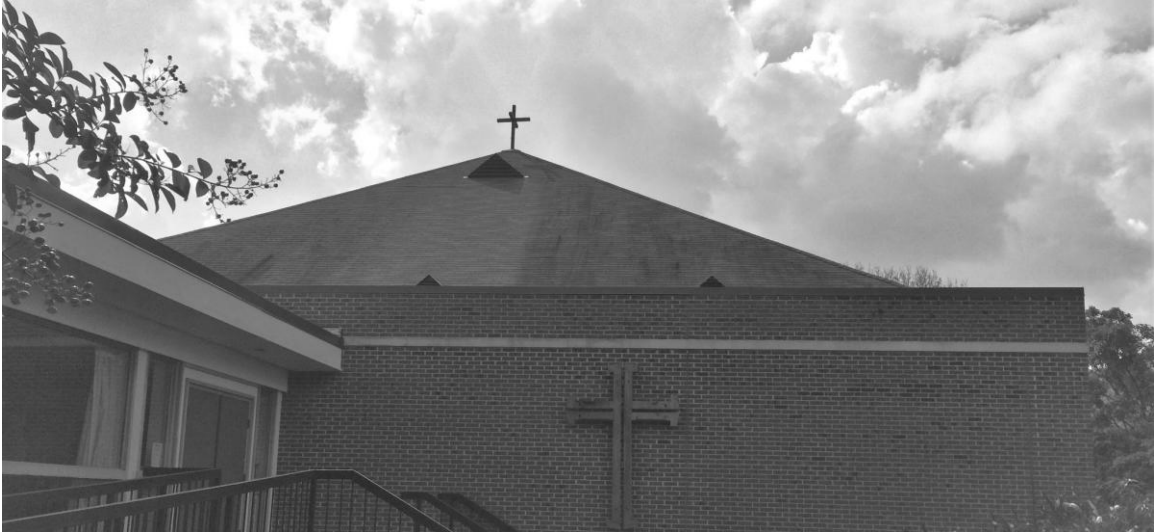
Sanctuary Steeple Cross