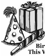
Birthdays This Week