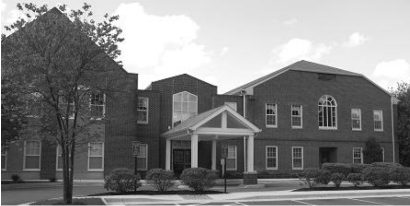
Spring St. Entrance