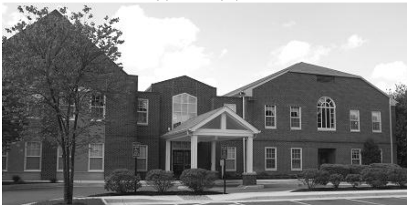
Spring St. Entrance