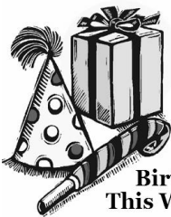
Birthdays This Week