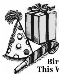
Birthdays This Week