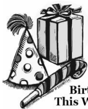
Birthdays This Week