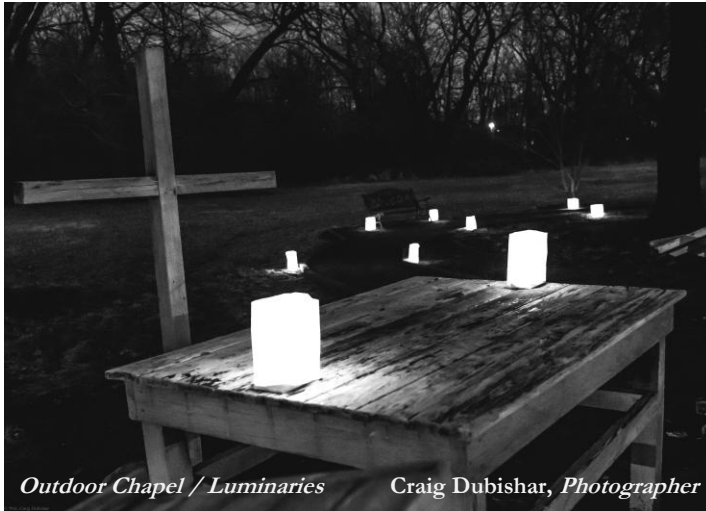
Outdoor Chapel / Luminaries